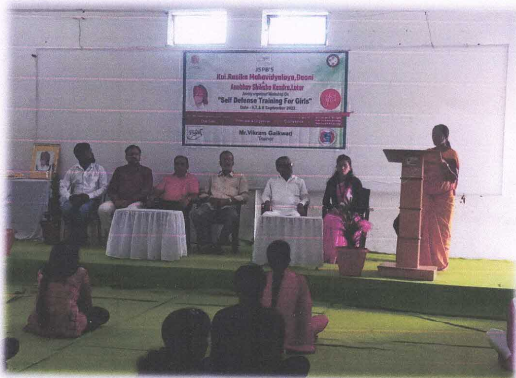
Self Defence Training camp for Girls by Alumni

[Signature] IQAC-COORDINATOR Kal. Rasika Mahavidyalaya, Deoni Tq. Deoni Dist. Latur