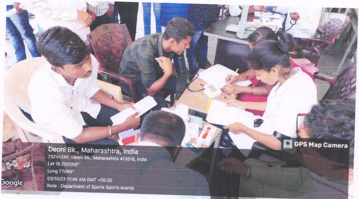
Alumni contribution in Health Check-up Camp organized by College

Signature IQAC-COORDINATOR Kal.Rasika Mahavidyalaya, Deoni Tq.Deoni Dist.Latur