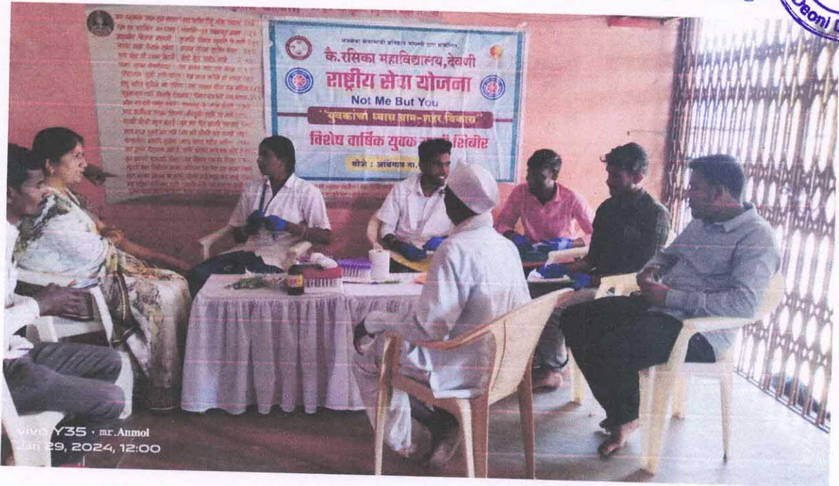
Alumni contribution in Health Check-up Camp organized by College