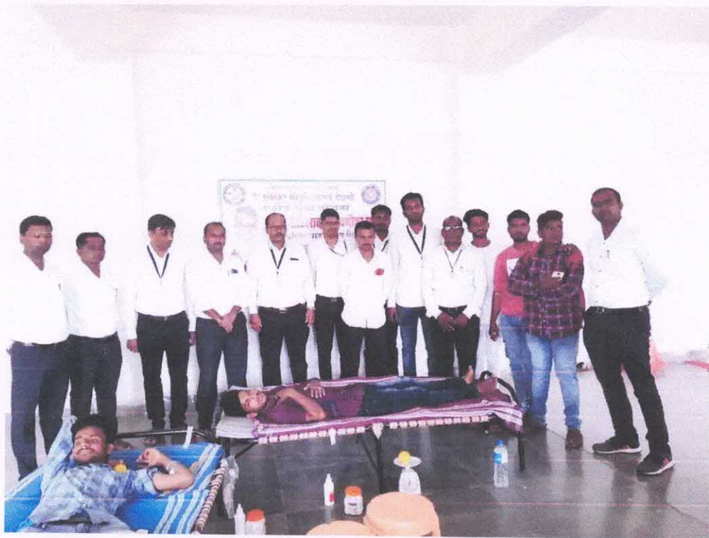
Blood Donated by alumni