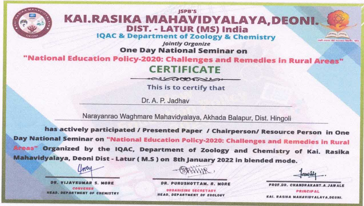
Sample Certificate of Event

Only attendee 200/ paper publication; 500/