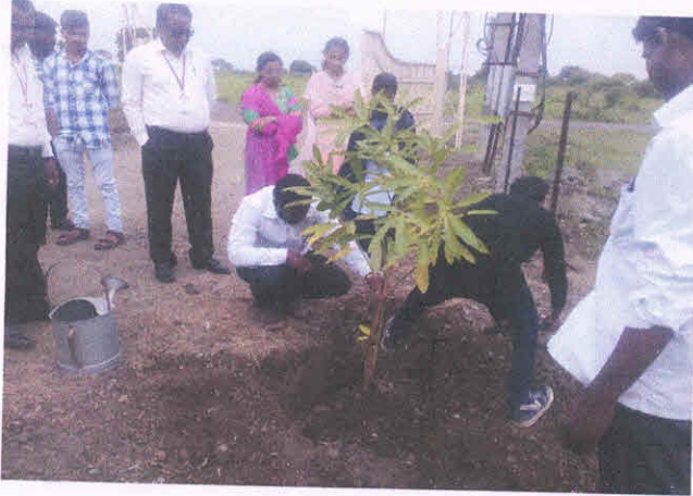
NSS Volunteers are planting trees