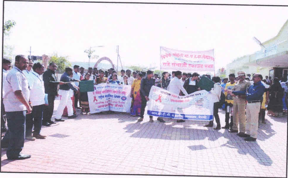
AIDS Rally in collaboration with Civil Hospital Deoni and Vivek Vardhani High school Deoni

Name of Activity – AIDS Awareness (A.Y. 2018-19)