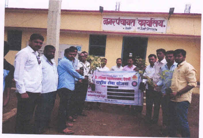
Saplings were given by Nagaranchayat Office Devani for tree treeplantation