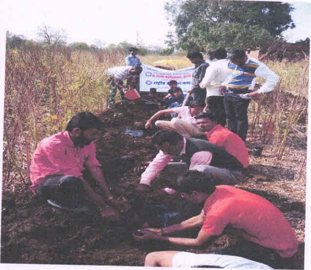
NSS Volunteers are preparing bags for planting samplins