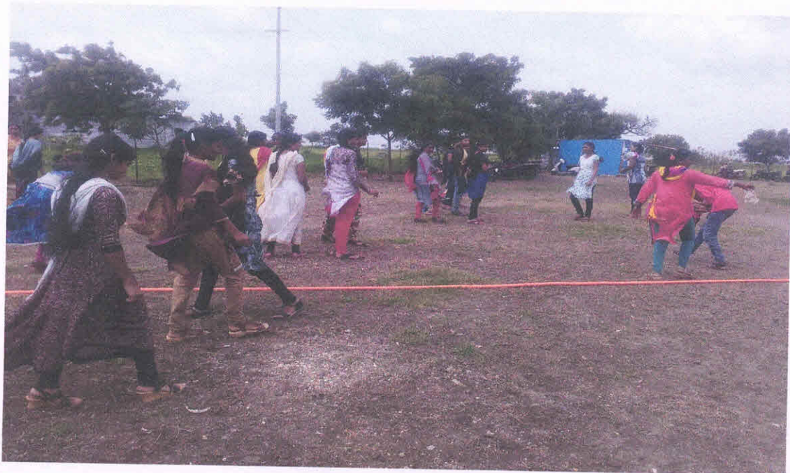
NSS Vullunters Cleaning the college campus

[Signature] IQAC-COORDINATOR Kai. Rasika Mahavidyalaya, Deoni Tq. Deoni Dist. Latur