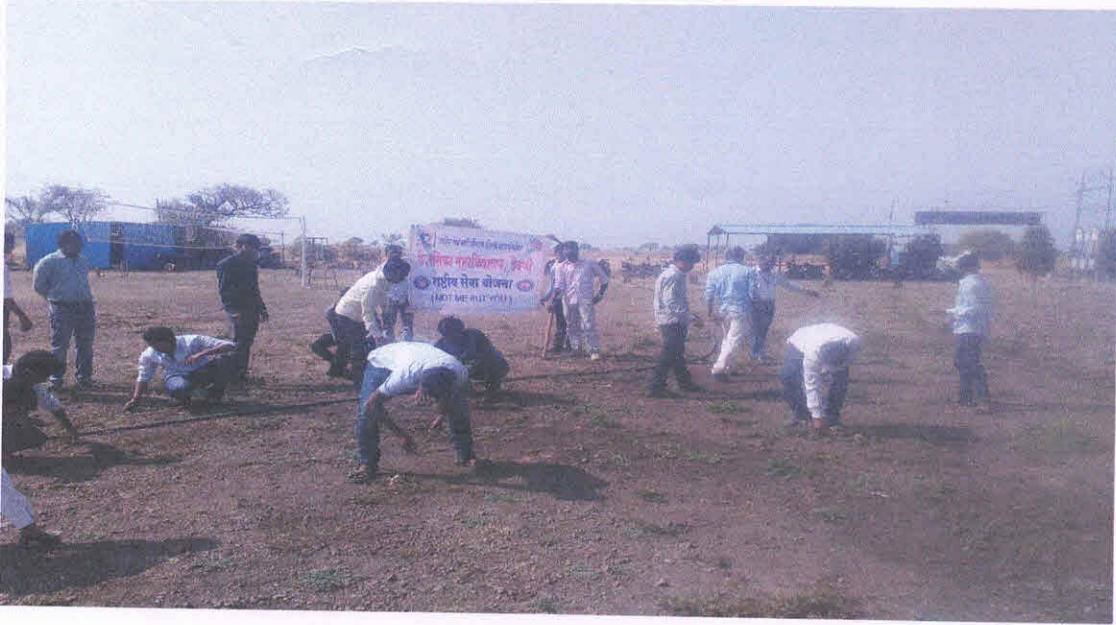
NSS Vullunters Cleaning the college campus