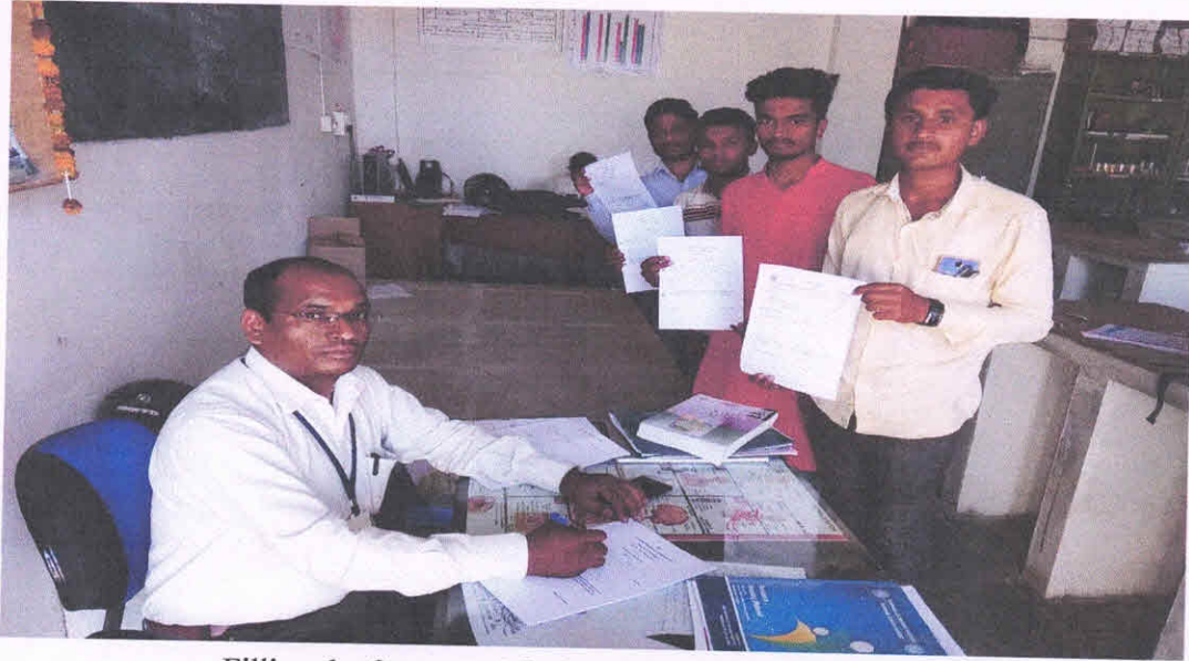
Filling the form no. 6 for inclusion of name in Electrol Roll