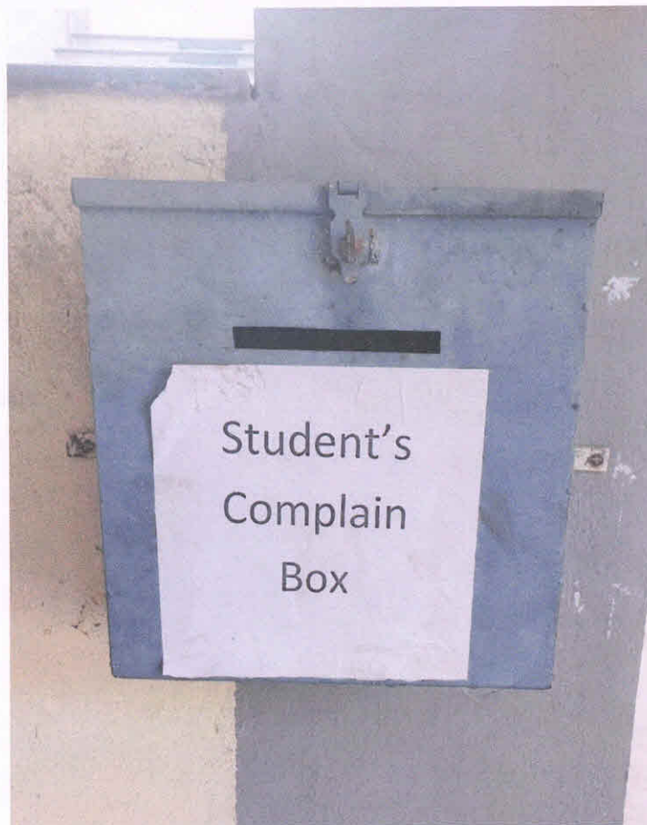
Suggestion and complaint box at College Administrative Building